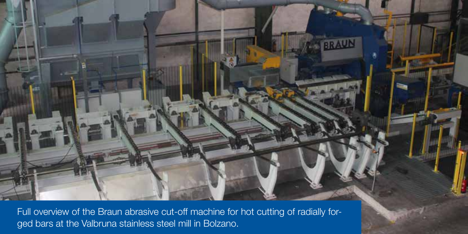
Full overview of the Braun abrasive cut-off machine for hot cutting of radially forged bars at the Valbruna stainless steel mill in Bolzano.

power ratings of 3 kW. The geared motors feature protection class IP55 and provide a reduction ratio of i=51.02 with an output speed of 28 rpm and an output torque of 1,012 Nm.