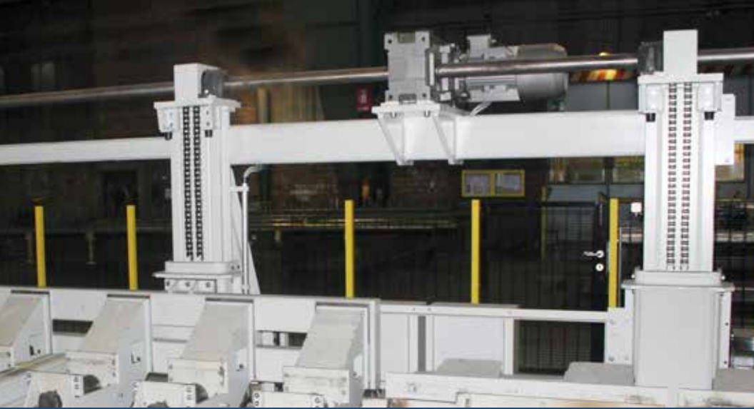
The height-adjustable roller table moves the various cut forged pieces from the forge manipulator to the higher roller table line of the abrasive cut-off machine.