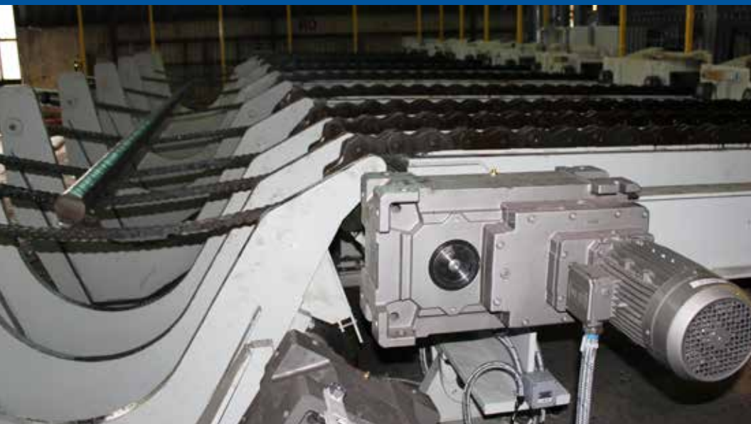
The chain conveyor and the swivel drive of the chain vat are both actuated by two Watt parallel shaft geared motors.